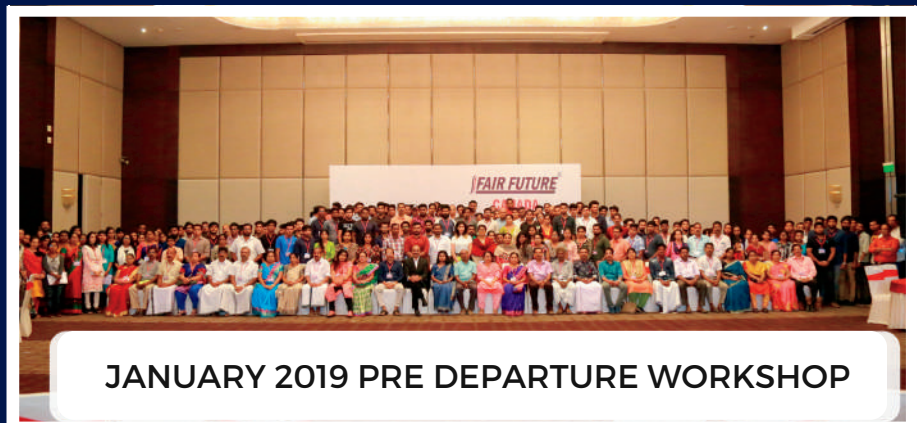
JANUARY 2019 PRE DEPARTURE WORKSHOP

PRE DEPARTURE SESSION FOR CLASS OF JANUARY 2019 AT HOTEL CROWNE PLAZA ON 04/11/2018.