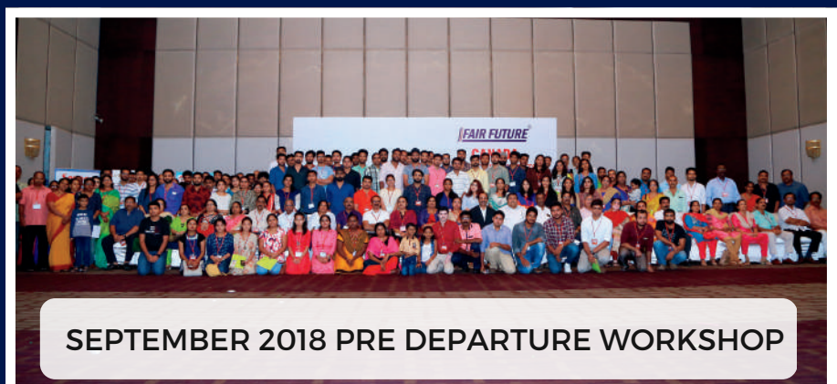
SEPTEMBER 2018 PRE DEPARTURE WORKSHOP

PRE DEPARTURE SESSION FOR CLASS OF SEPTEMBER 2018 AT HOTEL CROWNE PLAZA ON 08/07/2018.