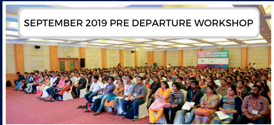
SEPTEMBER 2019 PRE DEPARTURE WORKSHOP

PRE DEPARTURE SESSION FOR CLASS OF SEPTEMBER 2019 AT HOTEL RADISSON BLU ON 07/07/2019.